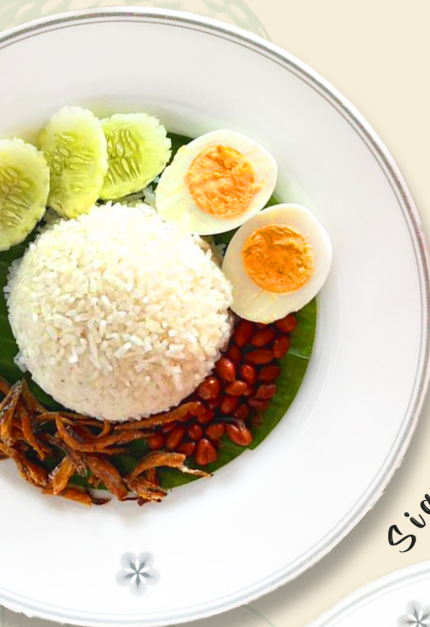
Signature Nasi Lemak