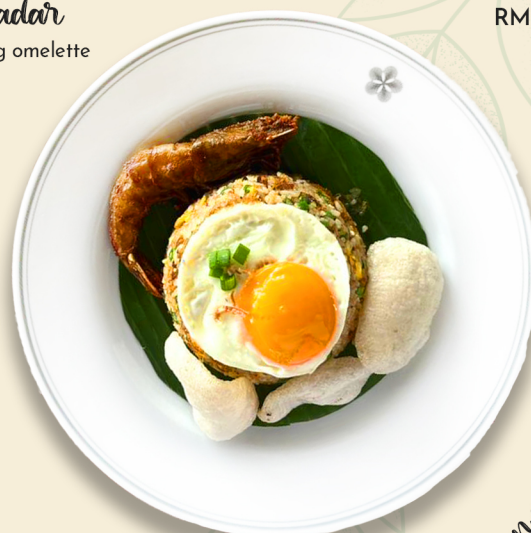
Kampung Fried Rice