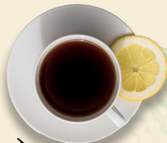
Teh 'O' Lemon