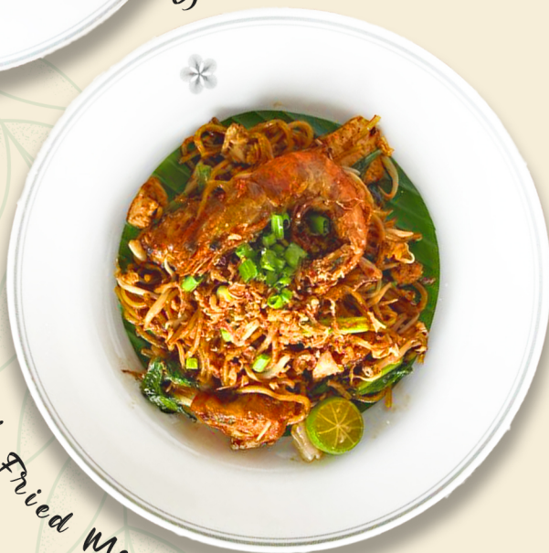
Mamak Fried Mee